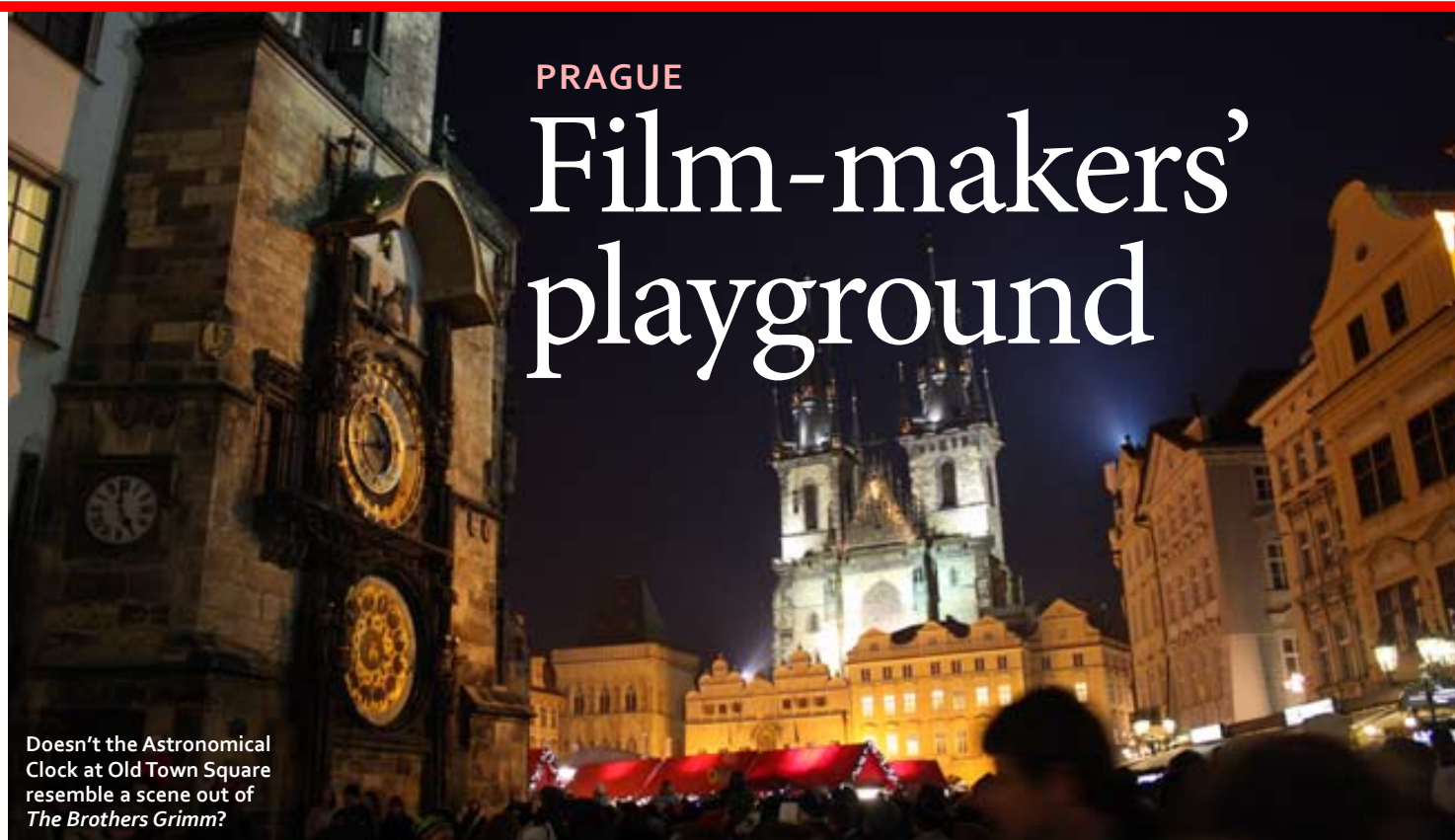
Doesn't the Astronomical Clock at Old Town Square resemble a scene out of The Brothers Grimm ?

Dubbed the "City of a Hundred Spires", the Czech capital is renowned for its dramatic skyline, fairytale castles and medieval towers. Downtown Prague, meanwhile, is a gleaming modern centre. The eclectic combination makes the city an ideal setting for a variety of films — from contemporary to historical, to action — which a tour of film locations in Prague amply shows.