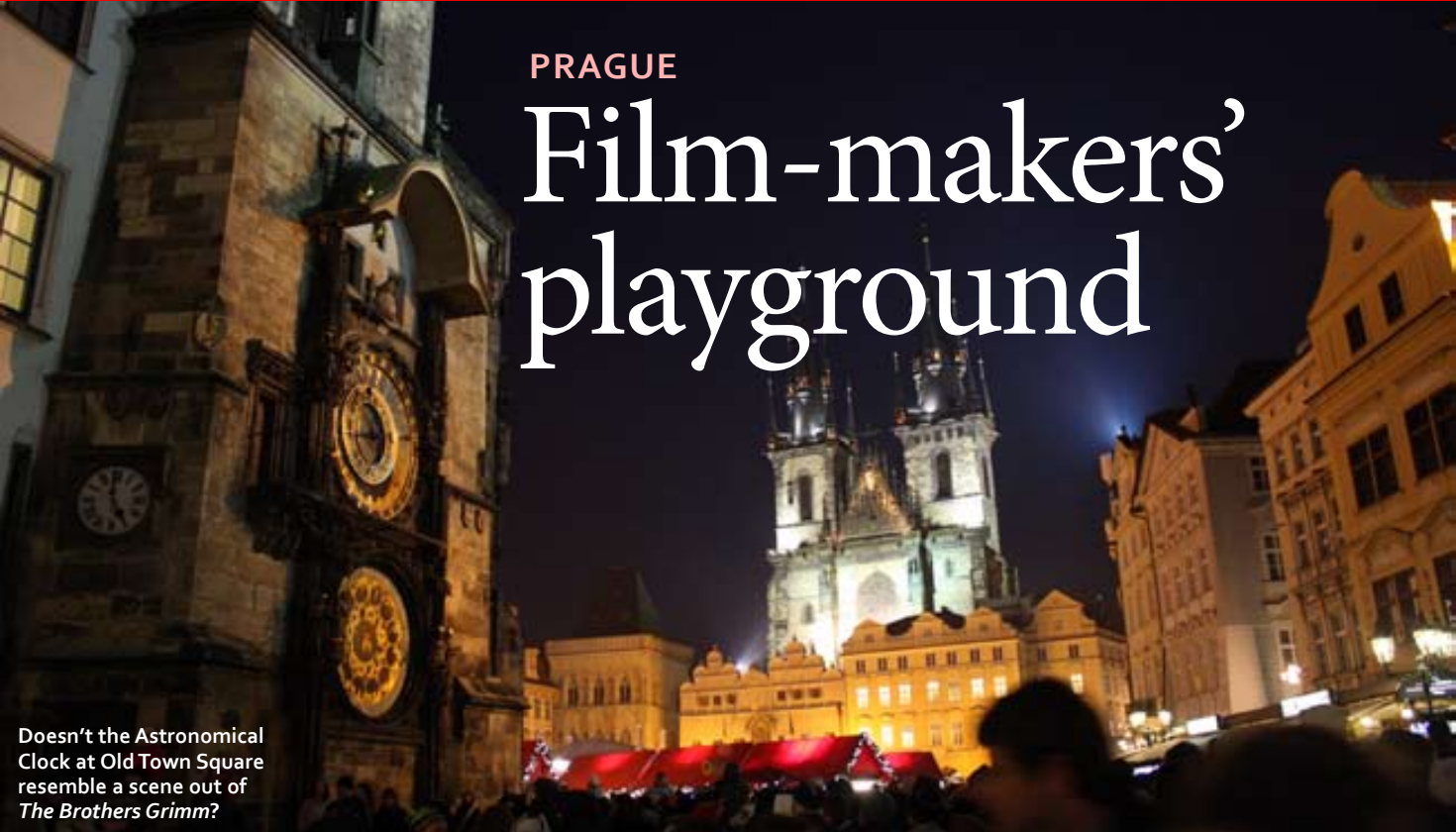
Doesn’t the Astronomical Clock at Old Town Square resemble a scene out of The Brothers Grimm ?

Dubbed the “City of a Hundred Spires”, the Czech capital is renowned for its dramatic skyline, fairytale castles and medieval towers. Downtown Prague, meanwhile, is a gleaming modern centre. The eclectic combination makes the city an ideal setting for a variety of films — from contemporary to historical, to action — which a tour of film locations in Prague amply shows.