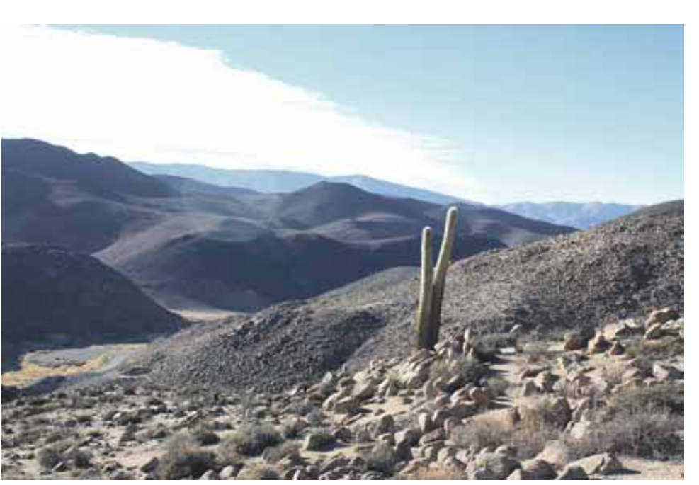
A lone cactus stands on the vast, empty hills of the Andean Altiplano.

*London/Paris/Frankfurt/Rome/Milan *Dubai/Kuwait/Doha/Bahrain/Abu Dhabi/Musca