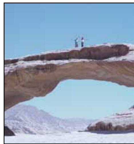
Umm Frouth Rock Bridge at Wadi Rum.

The further we travelled through Wadi Rum, the more it seemed to expand. The feeling was intensified when we arrived at Wadi Umm Ishrin. Undulating sand dunes rolled into the horizon. Mohammed skilfully manoeuvred the 4x4 up and down the dunes, ramping the accelerator to prevent us from getting stuck in the sand. The