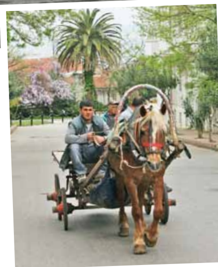
Ferry setting sail from Istanbul (above); spotted: farmers taking five on the horse-drawn cart (right)

Enter a world of calm seas and secret coves in Turkey where princes once found refuge