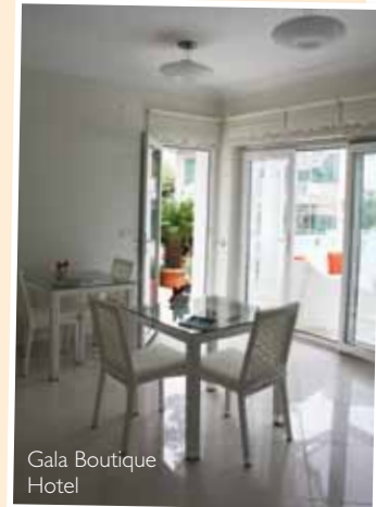
Gala Boutique Hotel

Buyukada eat and stay: Among a row of restaurants, Miltos Fish Restaurant (Gulistan Caddesi 16; www.miltorest.com ) dishes out a scrumptious dish of grilled trout ($10) and some authentic Turkish delights as apres-lunch desserts. If you're looking to stay on the island for the night, brand new Gala Boutique Hotel (Cankaya Caddesi 3; www.galaboutique-hotel.com , from $60) offers plush furnishing in a mansion setting.