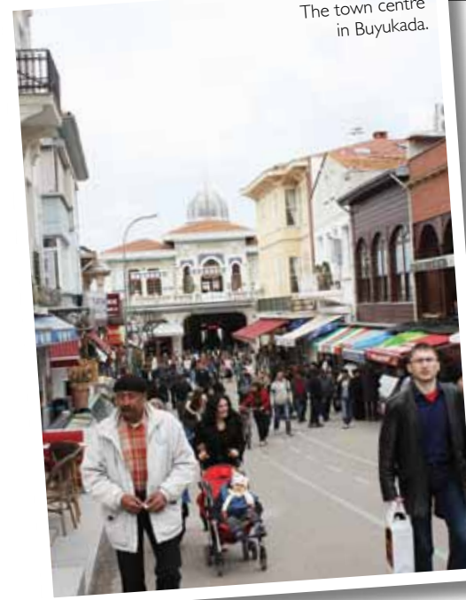
The town centre in Buyukada.

This is one of the Adalar's quietest islands, perfect for those escaping the summer crowd. For the active traveller, there are some excellent hiking trails that lead to the inland cliffs and an awe-inspiring panorama from the highest peak. Several downhill paths allow access to quiet sandy bays that are ideal for a refreshing dip and a cosy picnic.