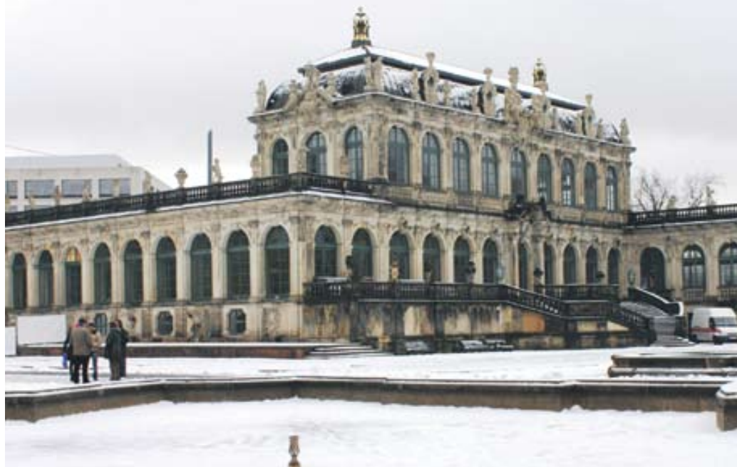
Special effect: Dresden's baroque edifices look even more stunning when draped in snow.

Experience the city as its people do — on a bicycle BY NELLIE HUANG