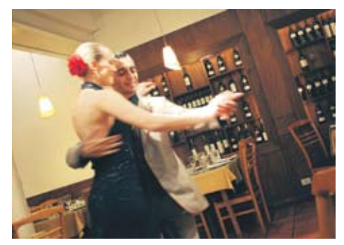
A typical tango show in Buenos Aires.