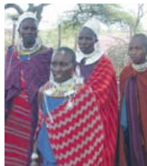
The natives: Get up close with Tanzania's wildlife and Maasai.

Diving enthusiasts should head out to Zanzibar: