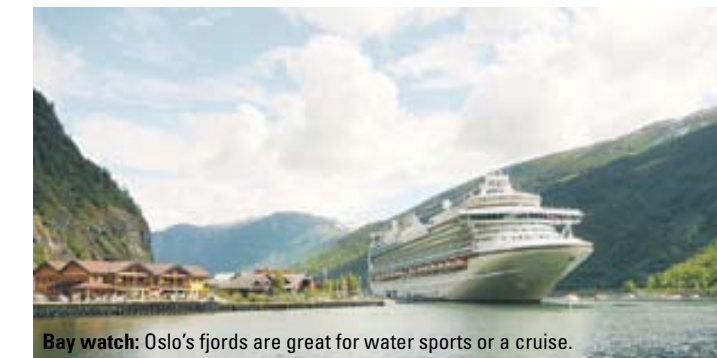
Bay watch: Oslo's fjords are great for water sports or a cruise.

Tour Operators: Fjord Tours ( www.fjordtours.com ) offers fjord voyages around the country, Gap Adventures ( www.gapadventures.com ) are reputed for well-organised guided Arctic tours. Nordic Visitor ( www.norway.nordicvisitor.com ) arranges ski trips to the best stations in Norway. [ traveller@mediacorp.com.sg ]