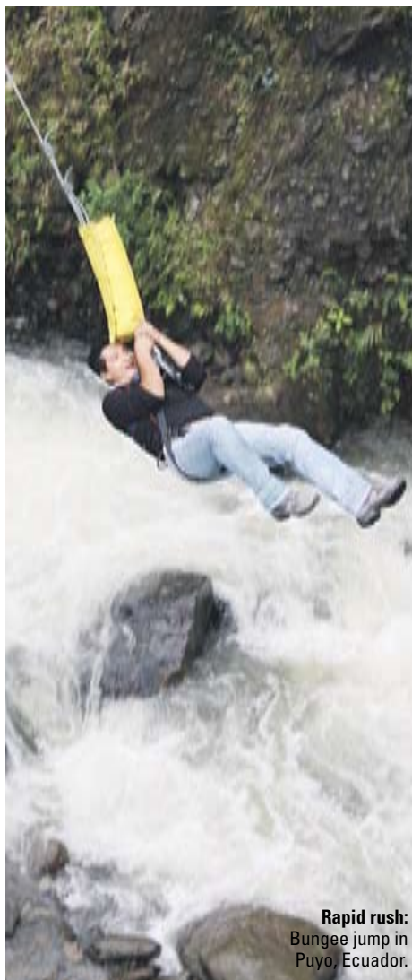
Rapid rush: Bungee jump in Puyo, Ecuador.