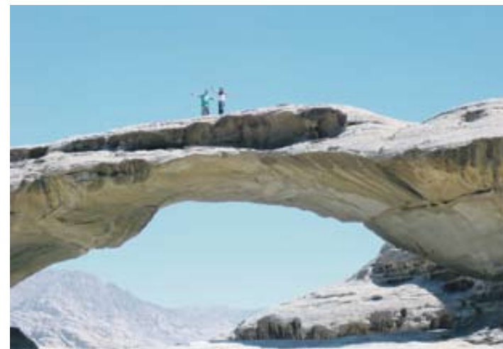
Great scale: Wadi Rum's odd rock formations make for challenging climbs in Jordan.

An archipelago of crystalline waters and lush jungle islands. Here, you can go deep sea fishing, sail on a traditional dhow or hike in the Jozani Forest. A vast country with peaks and an endless ocean, there's so much to do in Tanzania.